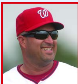
MANNY ACTA MANAGER